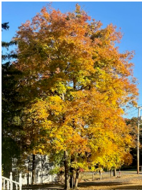
The parsonage's magic tree