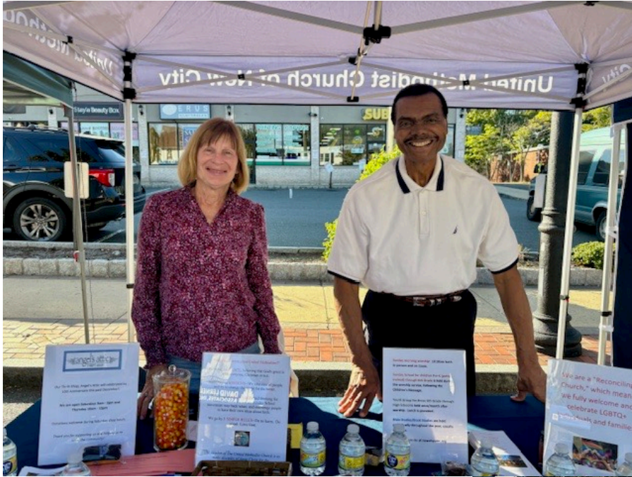
New City Street Fair